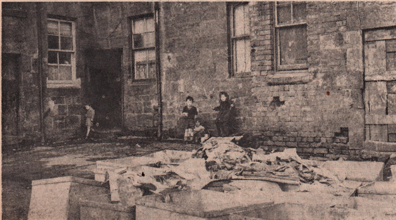
Shelter report shows that slum dwellers—like these in Glasgow—are virtually homeless

LABOUR PARTY CONFERENCE MILITANT READER'S MEETING