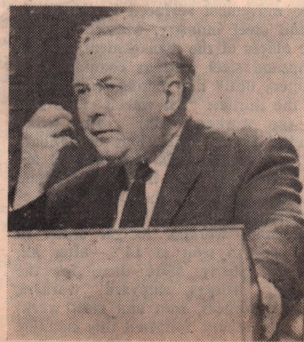
Wilson will probably get cherished Balance of Payments surplus, but who benefits?

What is needed is a real alternative to the present chaos. Bribing the capitalists does not pay off. Despite investment grants of £ millions Merseyside unemployment remains twice the national average, and there were 60,000 fewer jobs in Scotland last year than in 1964—a loss of output worth nearly £100 million. The millionaire G.E.E.C.-A.E.I. bosses lay off 16,000 workers, and still the national union leadership have not called for nationalisation. Yet, in Merseyside, Glasgow, the North East, South Wales, Northern Ireland, the misery and uproar will continue unabated until jobs and homes are found. And the capitalists will never be able to guarantee these minimum requirements. At the time of writing, half the car industry is at a standstill,